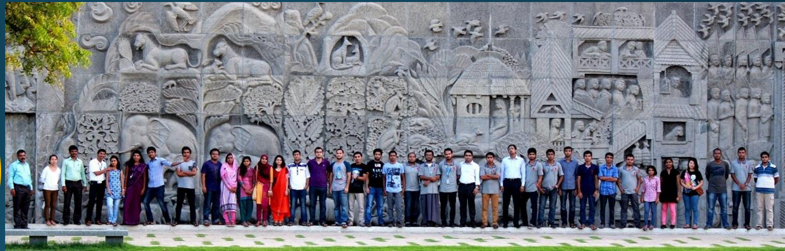
Students of Daffodil International University & University of Dhaka at Chennai, India

FROM THE DESK OF DIRECTOR OF STUDENTS' AFFAIRS DAFFODIL INTERNATIONAL UNIVERSITY